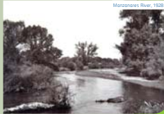
Manzanares River, 1928

Manzanares river and La Trofa stream create a connected fluvial system, meaning that to achieve its environmental recovery coordinated work in both riverbeds is necessary.